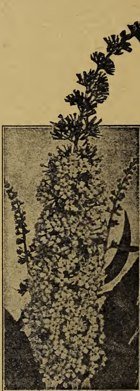
BUDDLEIA—BUTTERFLY BUSH Blooms from July until frost